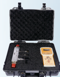
Hydraulic Oil Tester