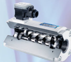
Screw Type PD Flowmeter