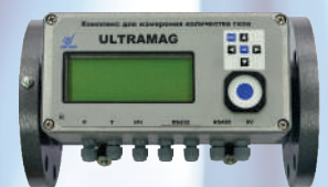
Ultrasonic Gas Flowmeter

Note: Development Dictates That From Time To Time The Data Shown Above Is Subject To Change Without Notice..pl Obtain A Offer.